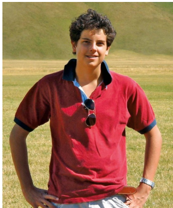
Blessed Carlo Acutis 3 MAY 1991 – 12 OCTOBER 2006

Carlo will be canonised in Rome on Sunday 7th September, along with Bl Pier Giorgio Frassati, who died 100 years ago in 1925, at the tender age of 24.