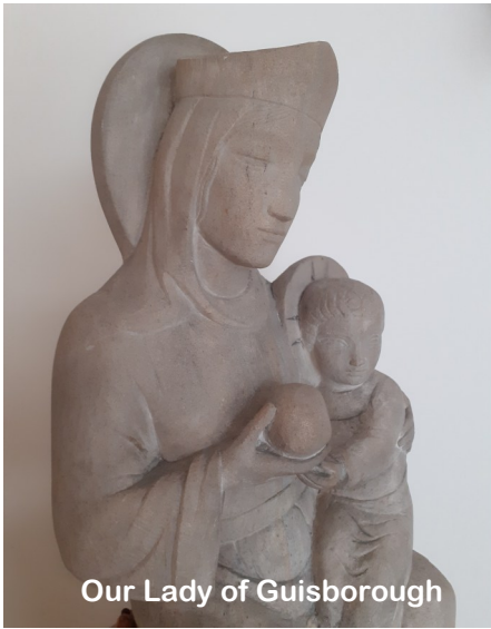
Our Lady of Guisborough