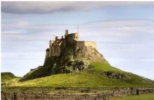
Holy Island Pilgrimage:

Castlerigg Manor is a Catholic residential youth centre in the Lake District and it's opening its doors to family groups and social groups this August. There are single rooms, twin rooms, and large family rooms at very cheap rates. Guests have access to the grounds, chapel, games room, and lounges, with Keswick and the Lake only a short walk away. For more info, e-mail director@castleriggmanor.co.uk